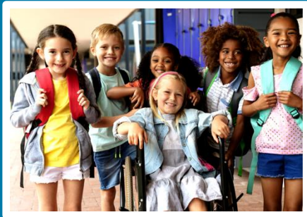
Protective Behaviours & Body Safety